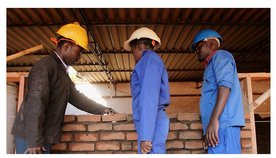
TEVET trainees learn bricklaying skills

Information on the new TMIS for TEVET Principals